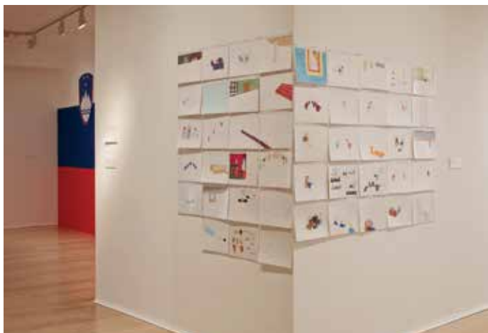
Installation view, Calvert 22, London, 2013, Photo: Stephen White