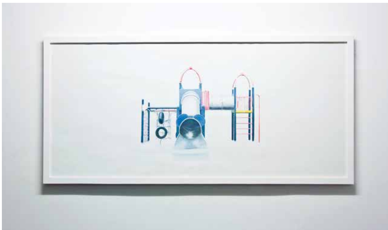
Grau Monument , from the series Children's Playgrounds - The Monuments Of A Void Childhood , Acrylic and graphite on canvas paper, 93 x 200 cm, 2010