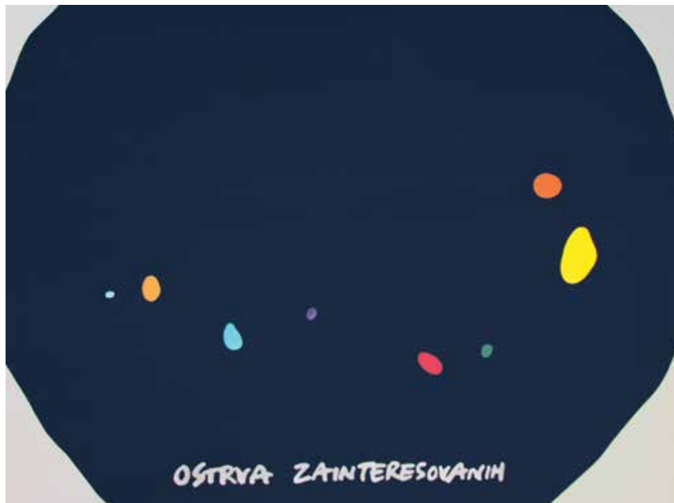
Islands of Interestad , metallic paint on aluminium, 92 x 124 cm, 2013