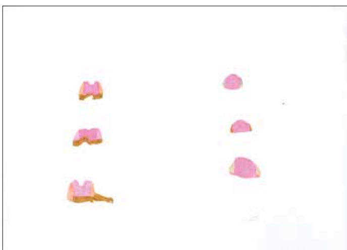
Precarious , 3 drawings, selected from the 40 drawing installation, felt tip pen on paper, 21 x 29,5 cm, 2010