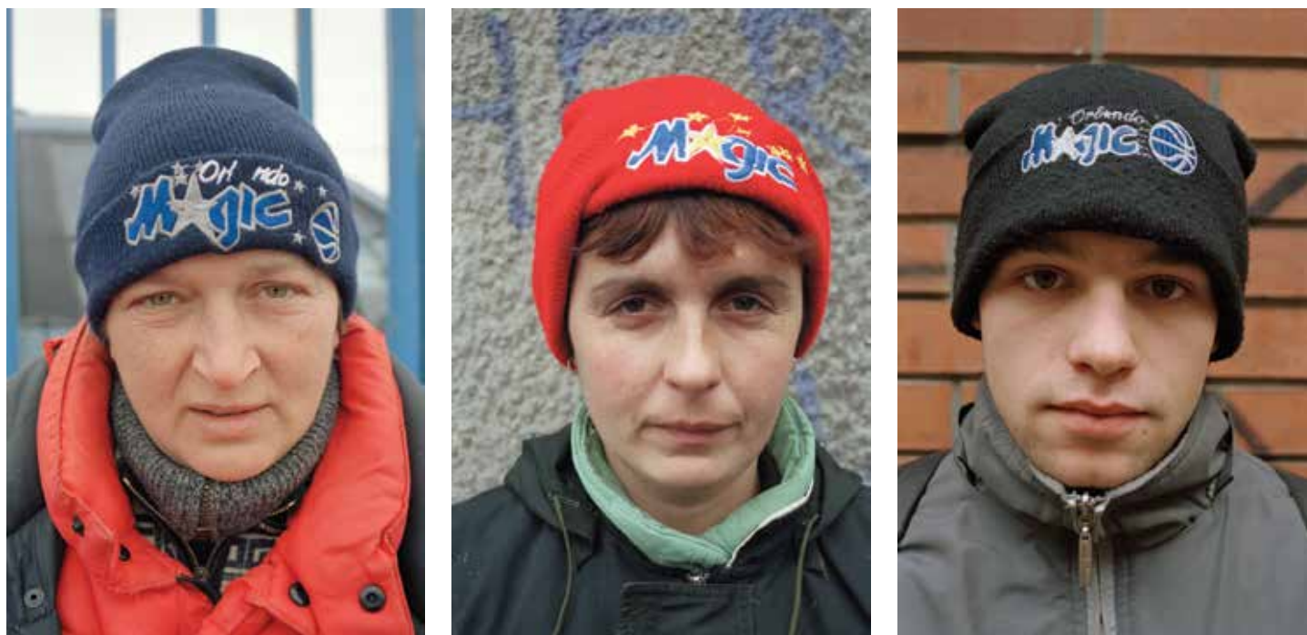
Orlando Magic , 3 photographs selected from the installation of 10, presented in 2014 by The street gallery - Micro Art, Belgrade, A4 format