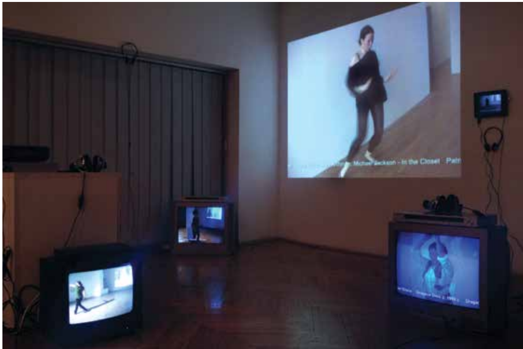
Remont, exhibition Prešlišavanje , Ivana Smiljanić "I Dance, Dance, Dance" exhibition view, 2012, photo by Milan Kralj