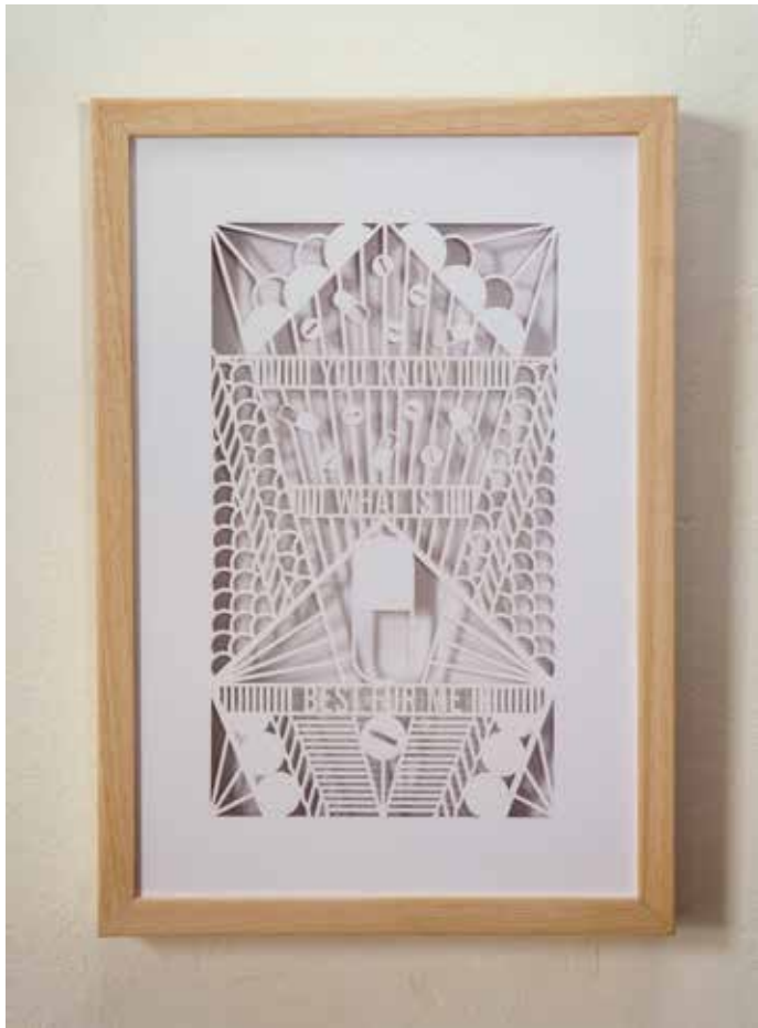
You know what is best for me. from the series of altars entitled About Faith Love and Hunger , Laser cut graphic, 42 x 30 cm, 2013